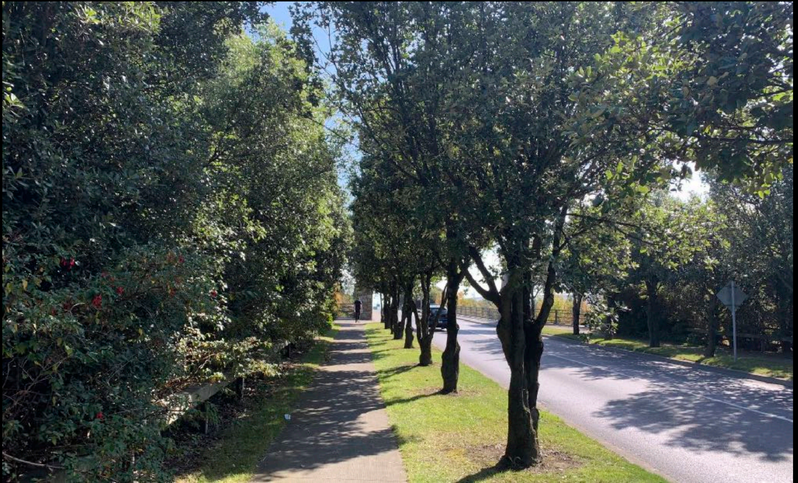
N7 Bridge and Evergreen Oak Trees