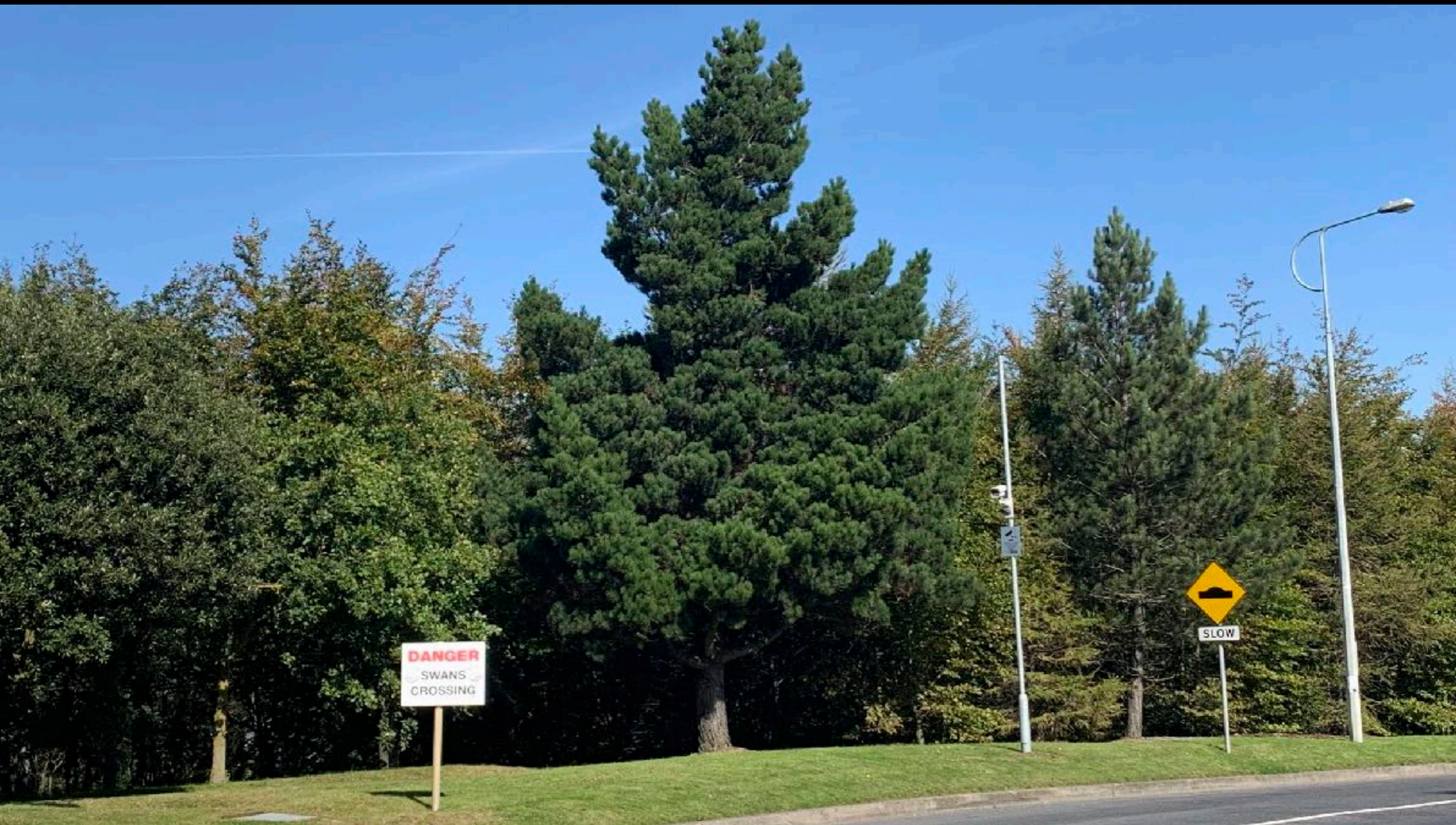
Mixed woodland edge to Citywest Avenue including mature Austrian Pine ( Pinus nigra )