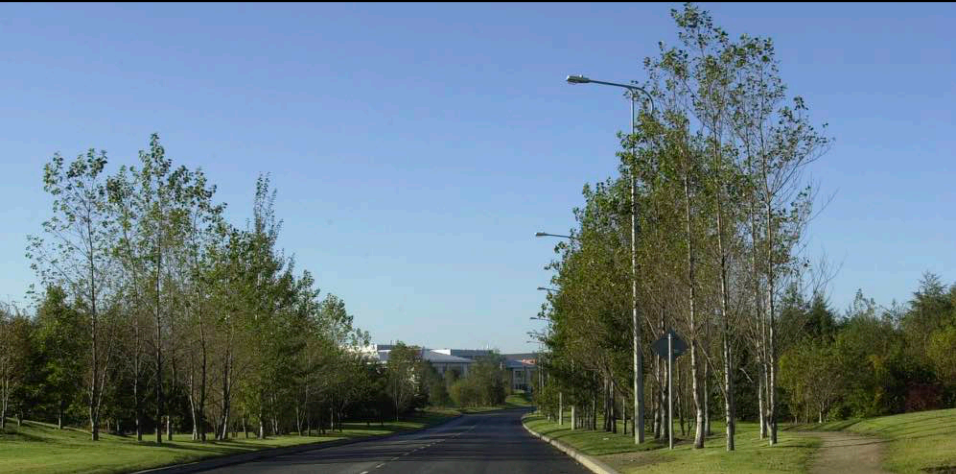
Mixed woodland edge to Citywest Avenue including a group of the original nursery plantation