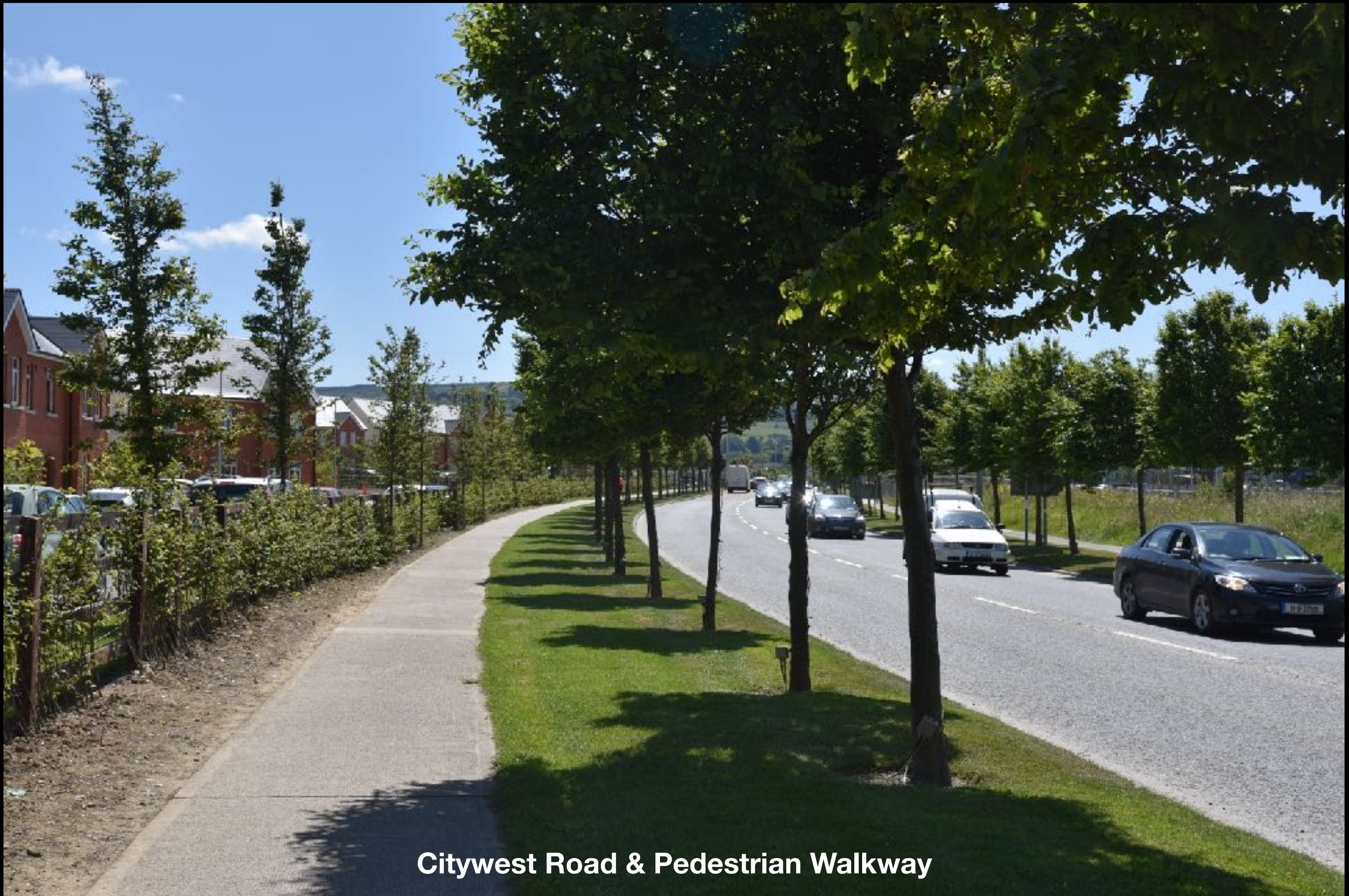
Citywest Road & Pedestrian Walkway

Double avenue of Hornbeam ( Carpinus betulus ) and Hornbeam hedging both sides of the road for screening, shelter, security, safety