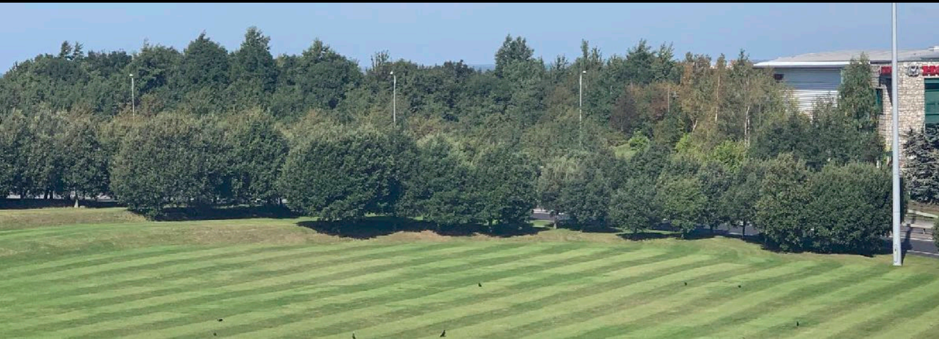
N7 Slip Road and Evergreen Oak Trees