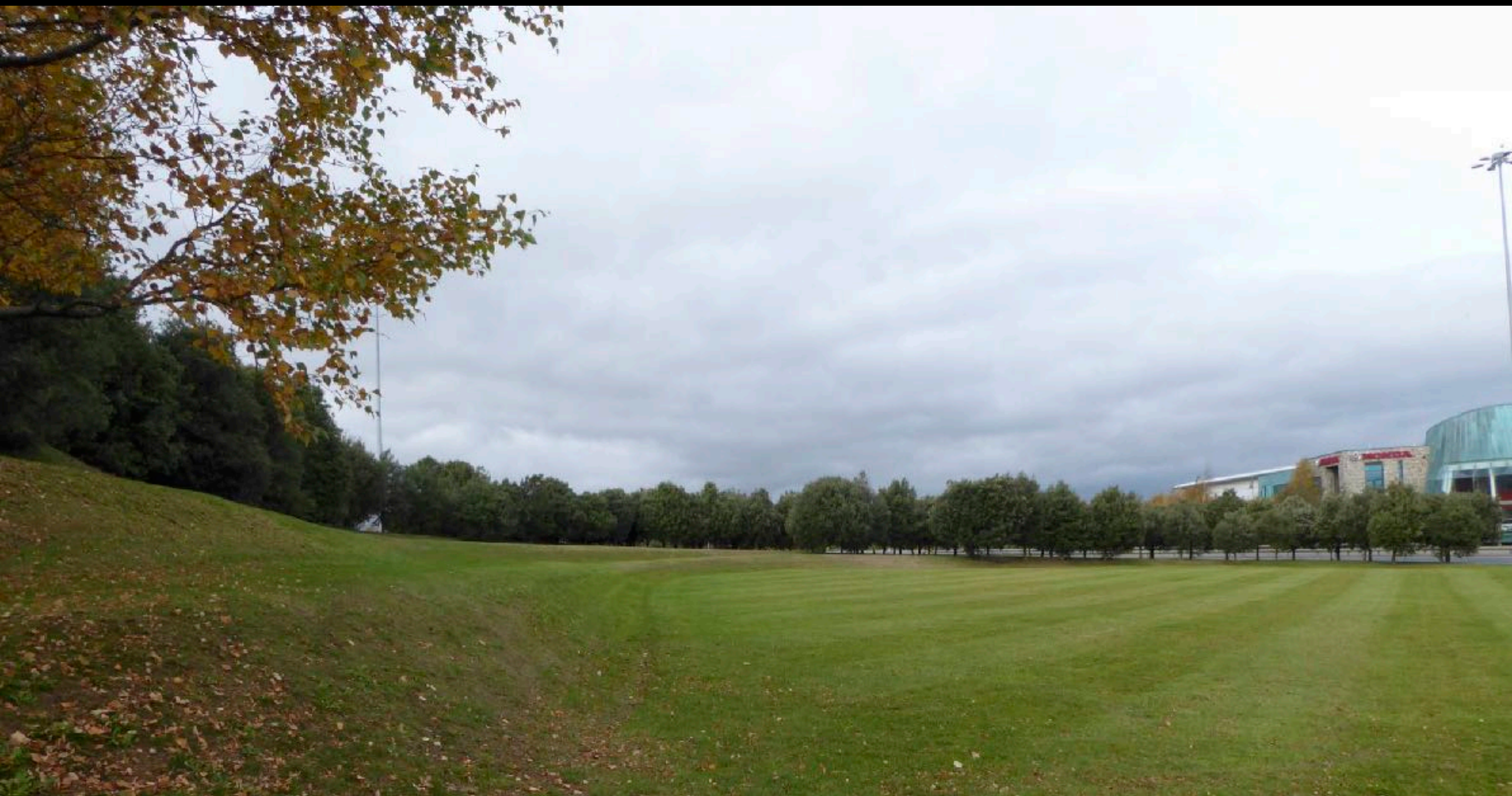
N7 Slip Road Terraces and Quadrant of Evergreen Oak