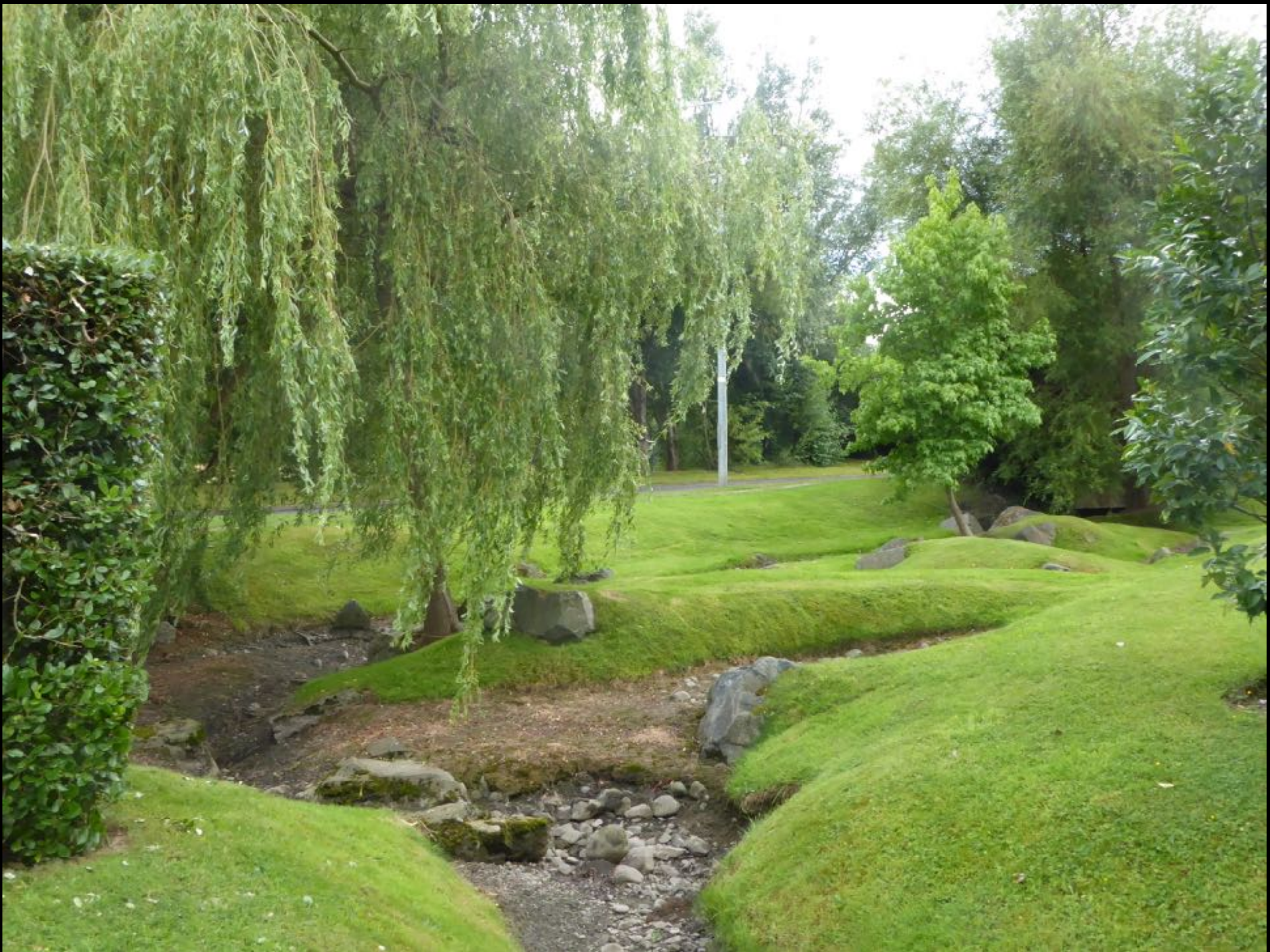
Small dry stream and Willow