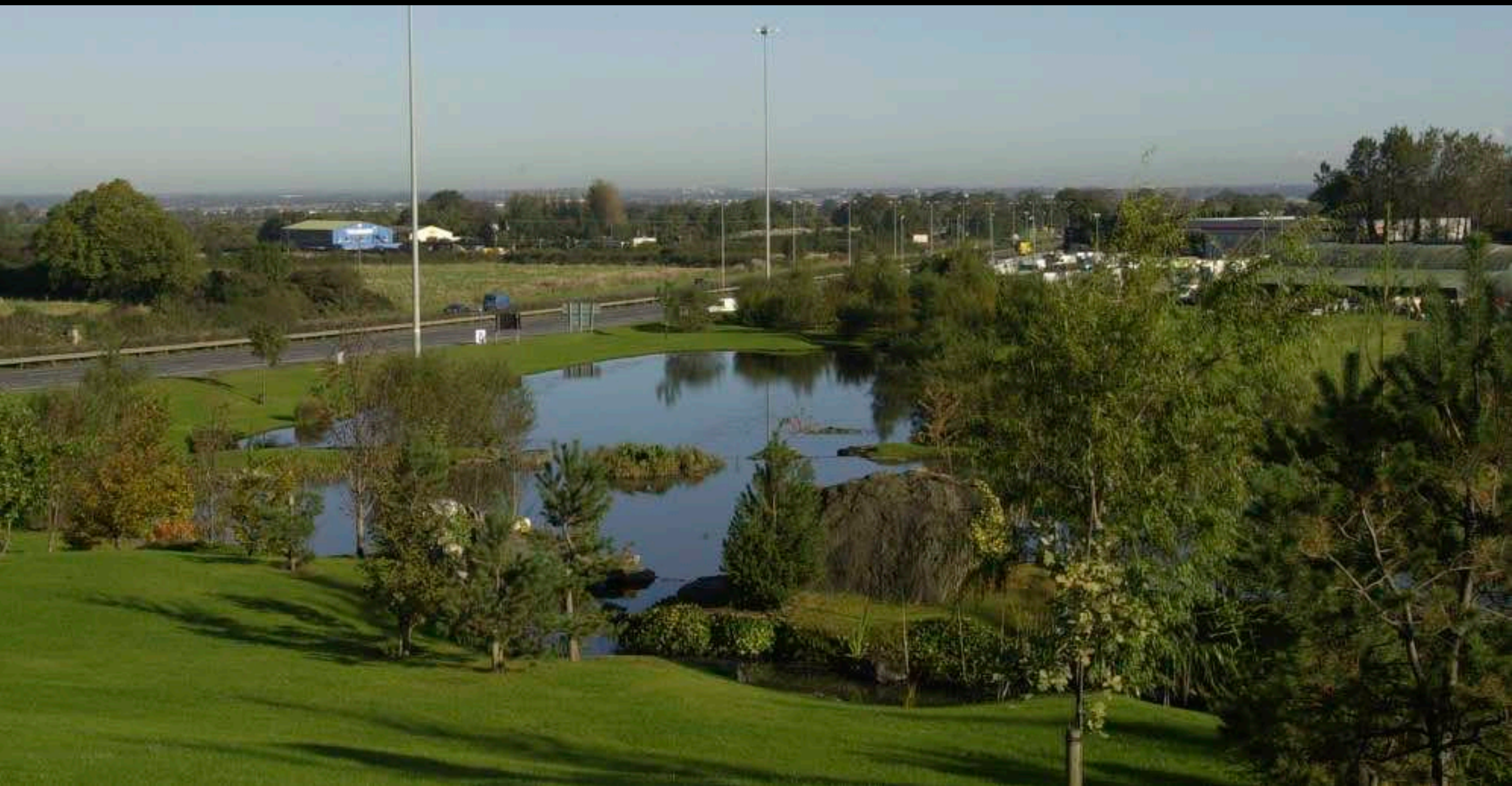
N7 Lake and Wooded Hillside Frontage