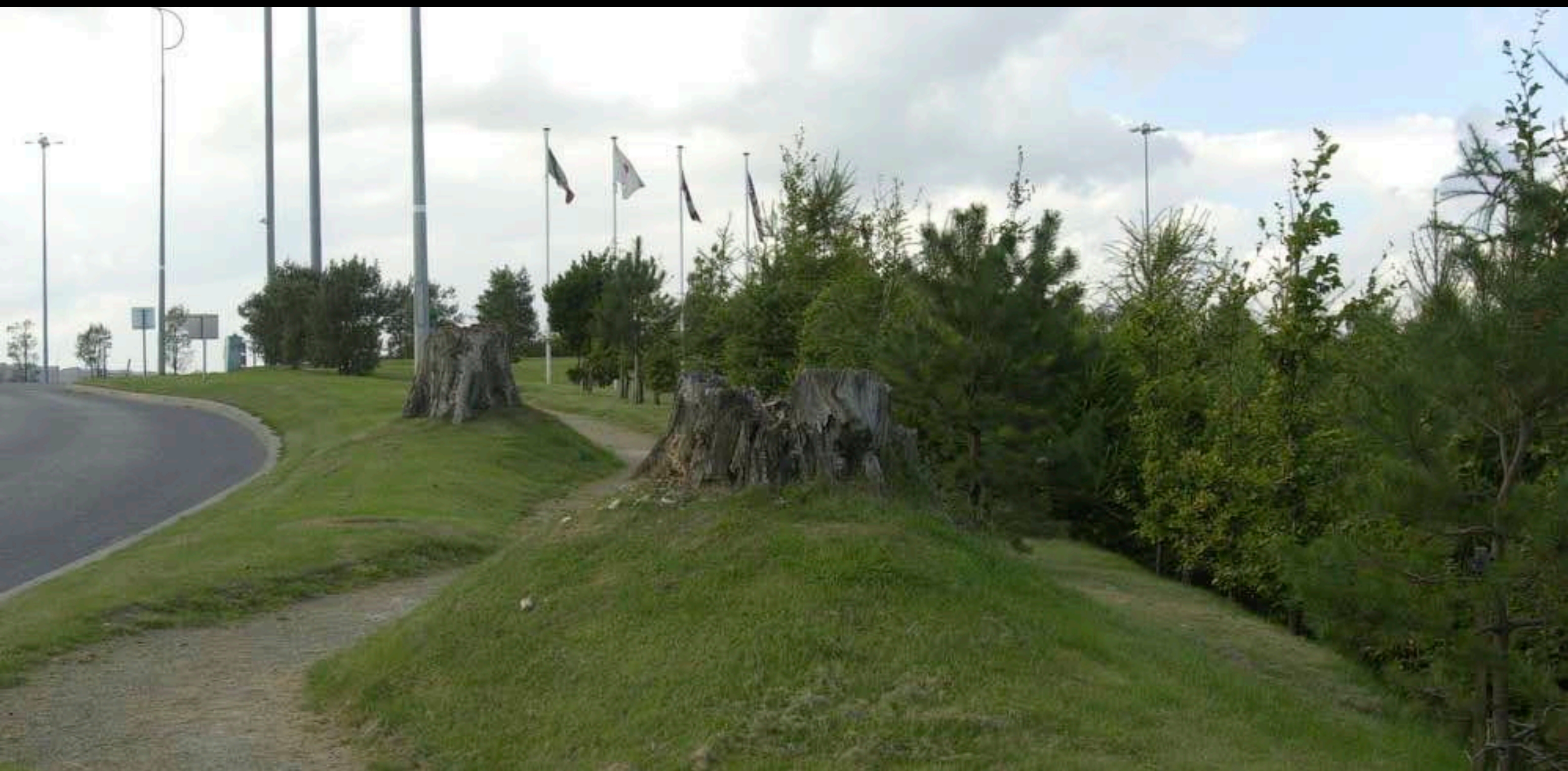
Tree Stumps used to age and shape the landscape, and to divert the winding path