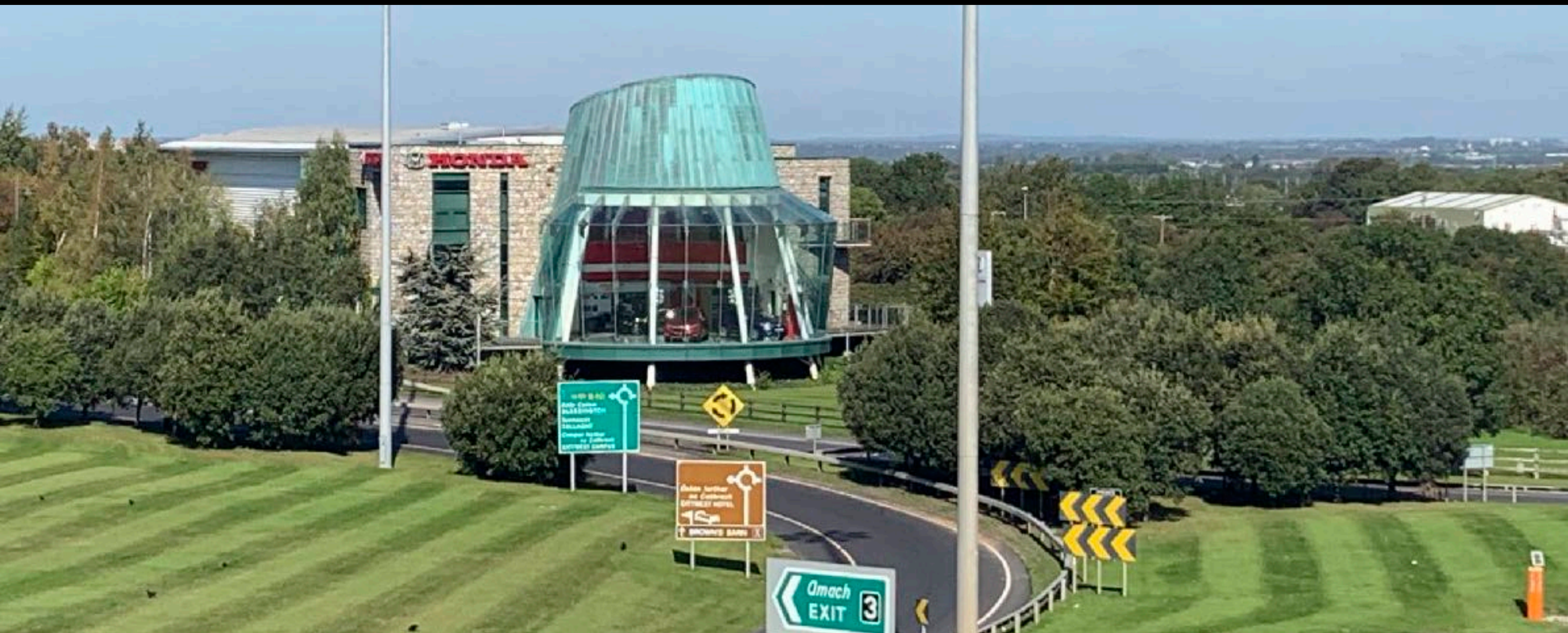
N7 Slip Road and Evergreen Oak Trees