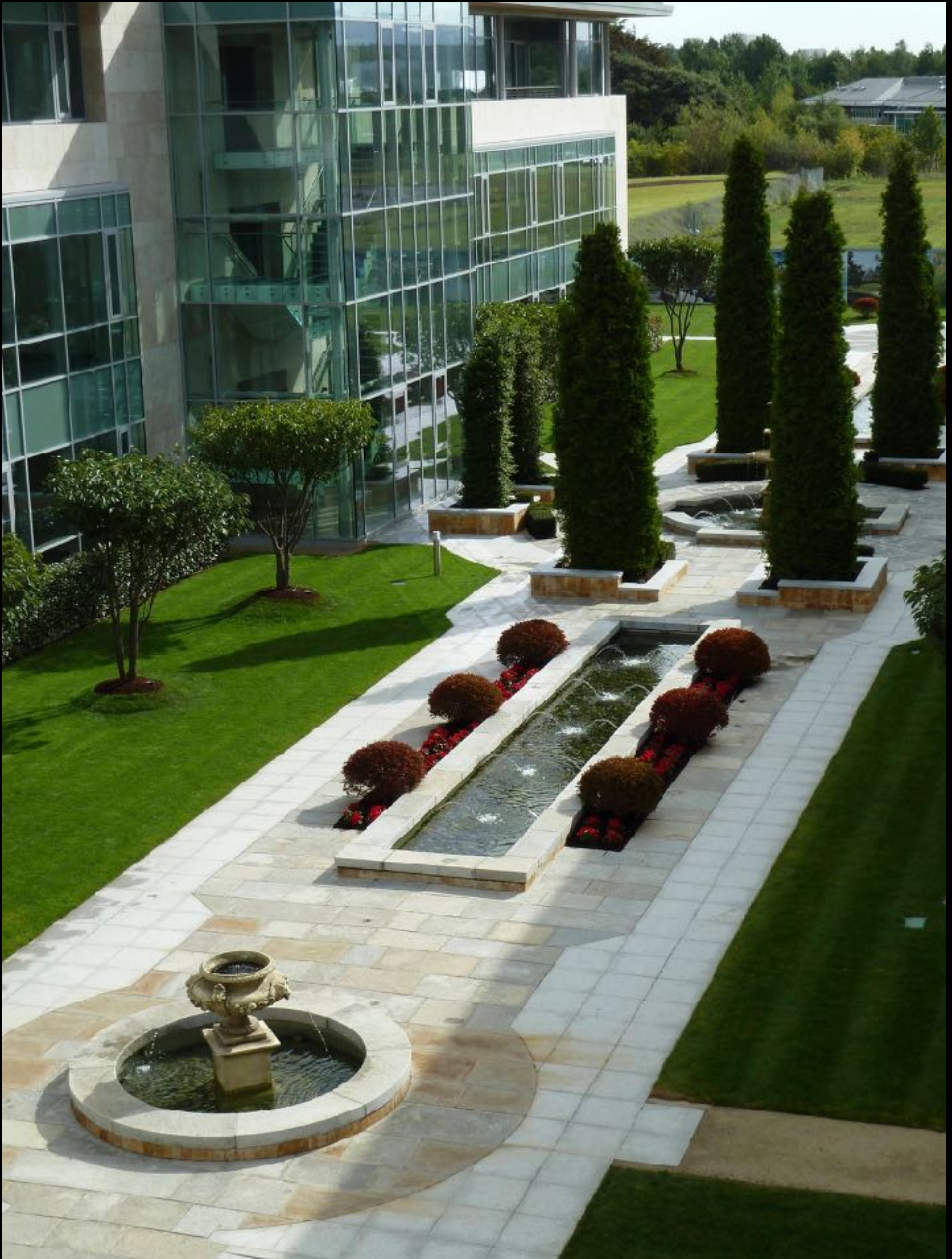
Waterside, Citywest Business Campus