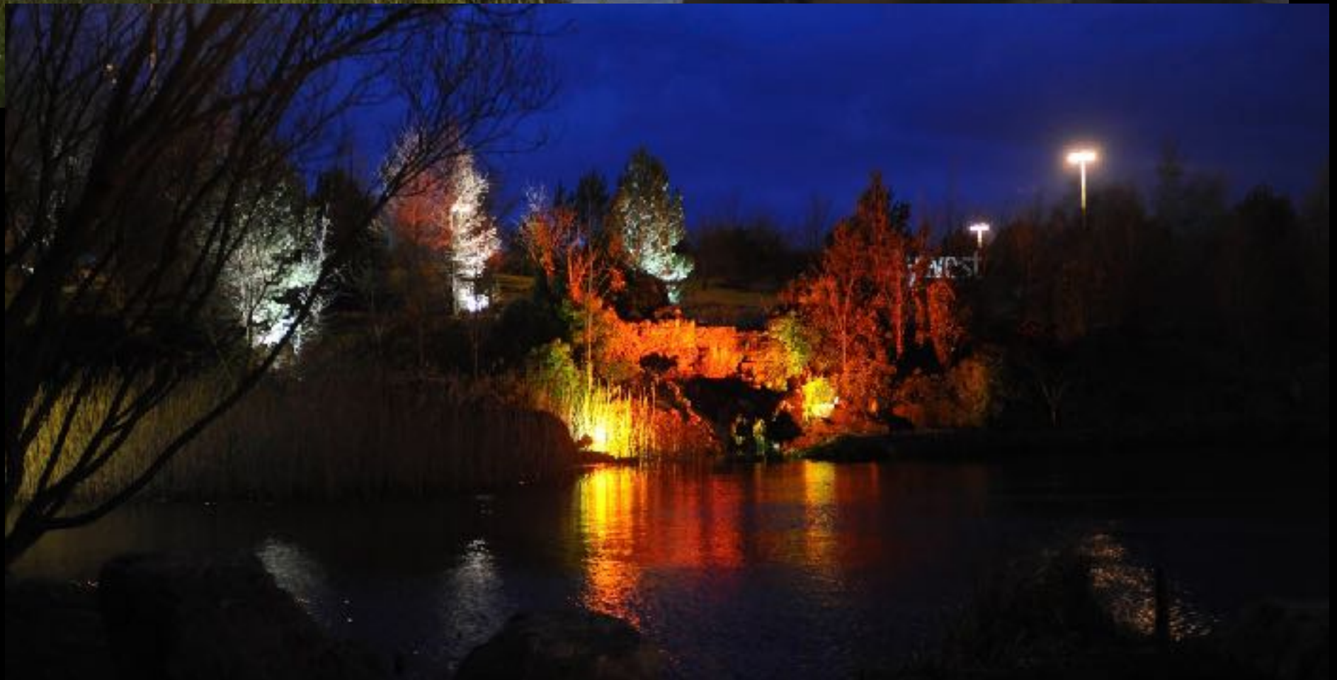
Waterside, Citywest Business Campus