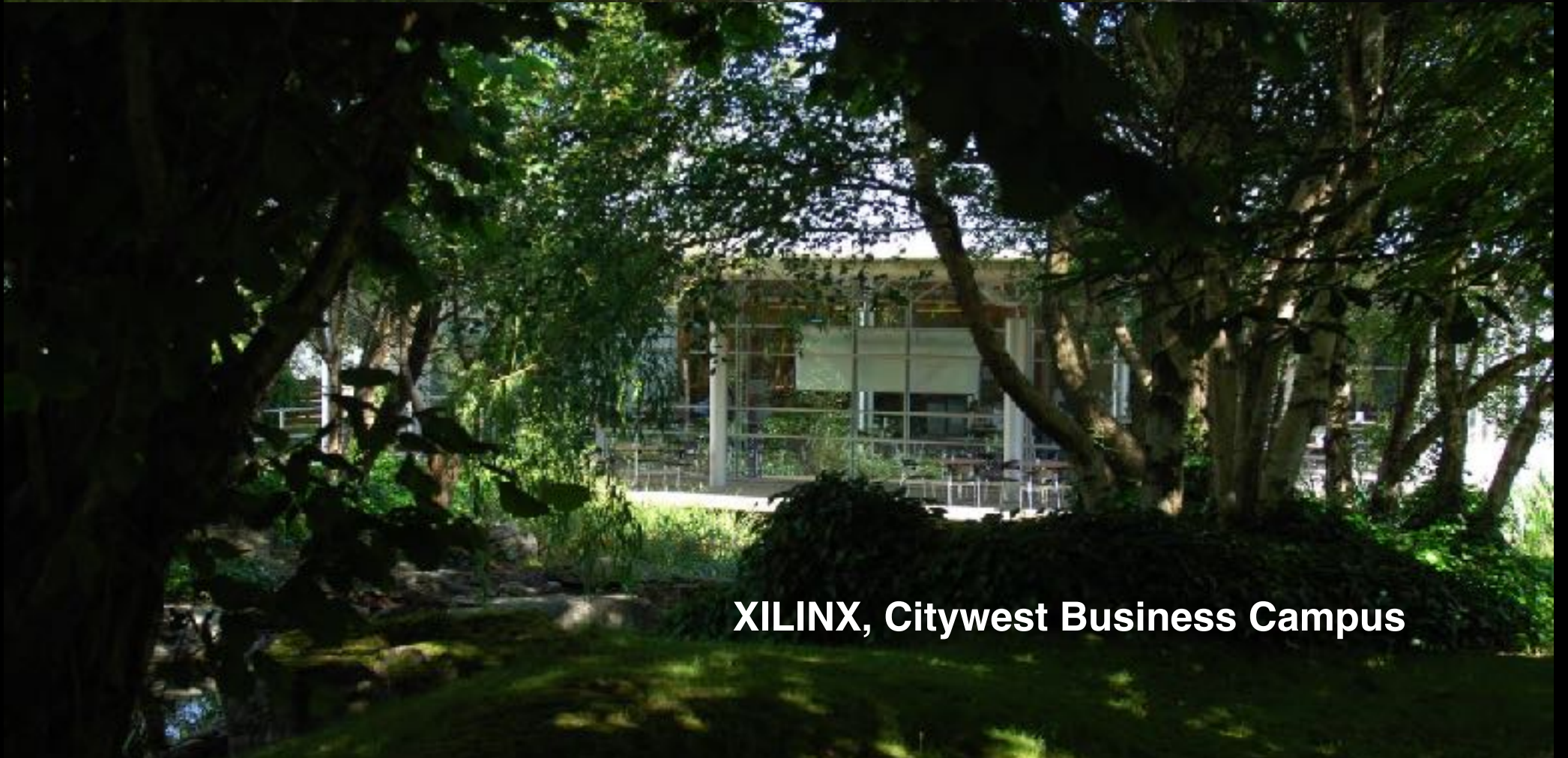
XILINX, Citywest Business Campus