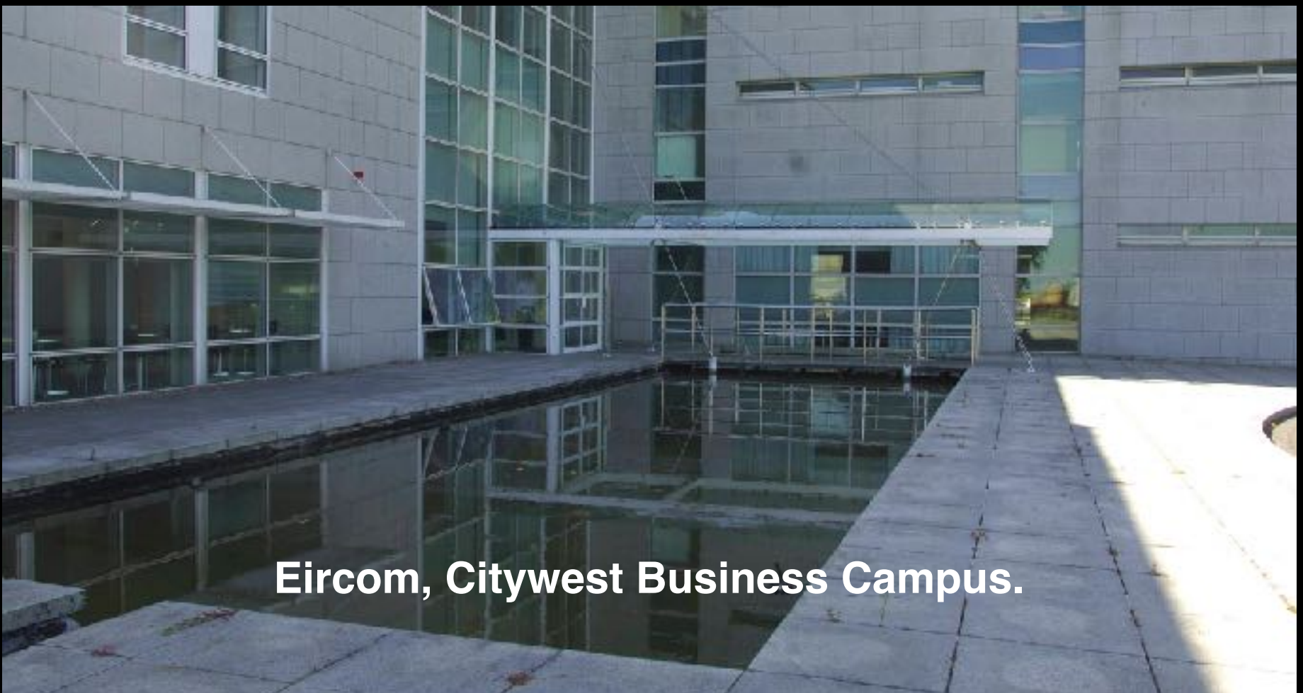
Eircom, Citywest Business Campus.