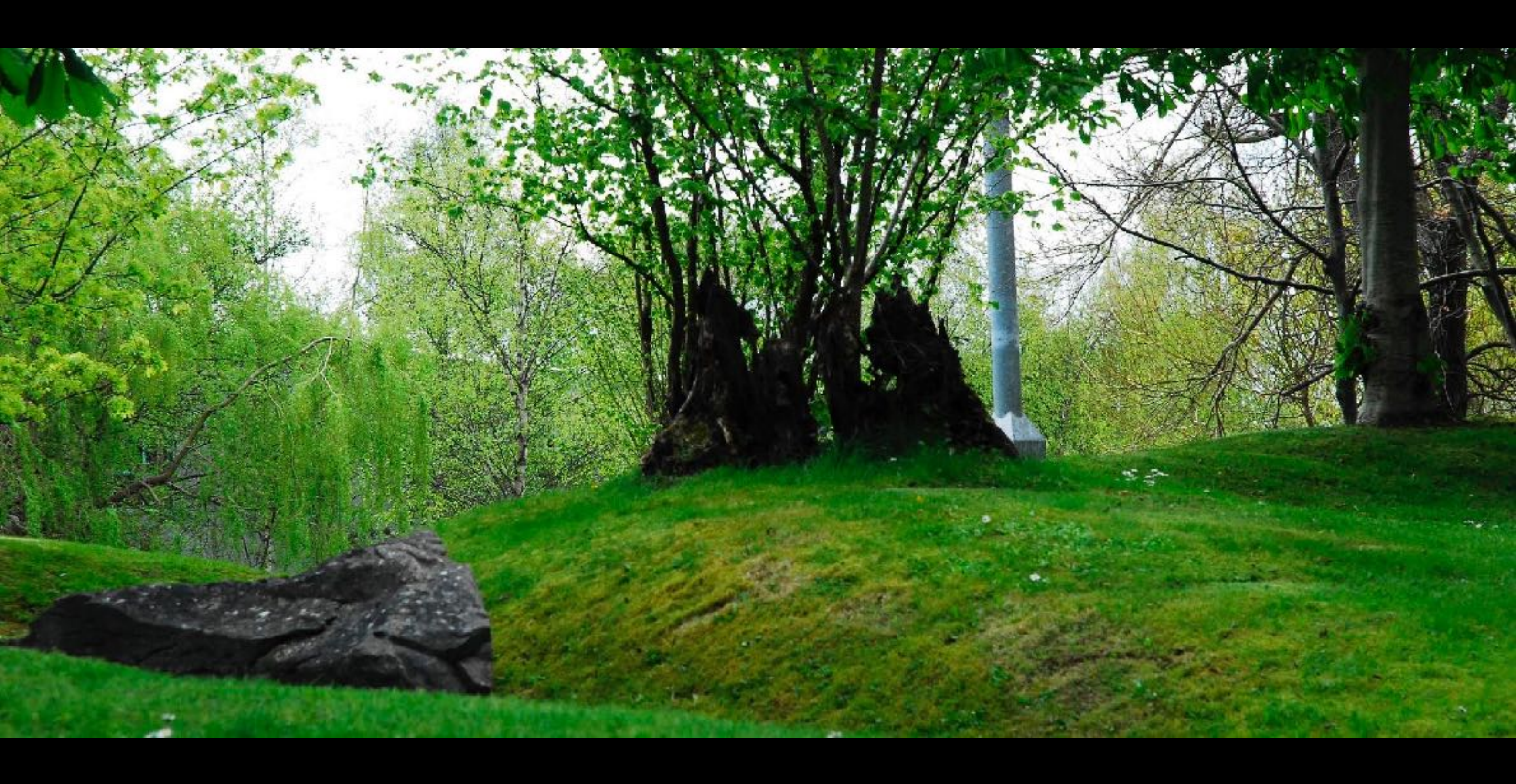
The root takes on a new life and a new form