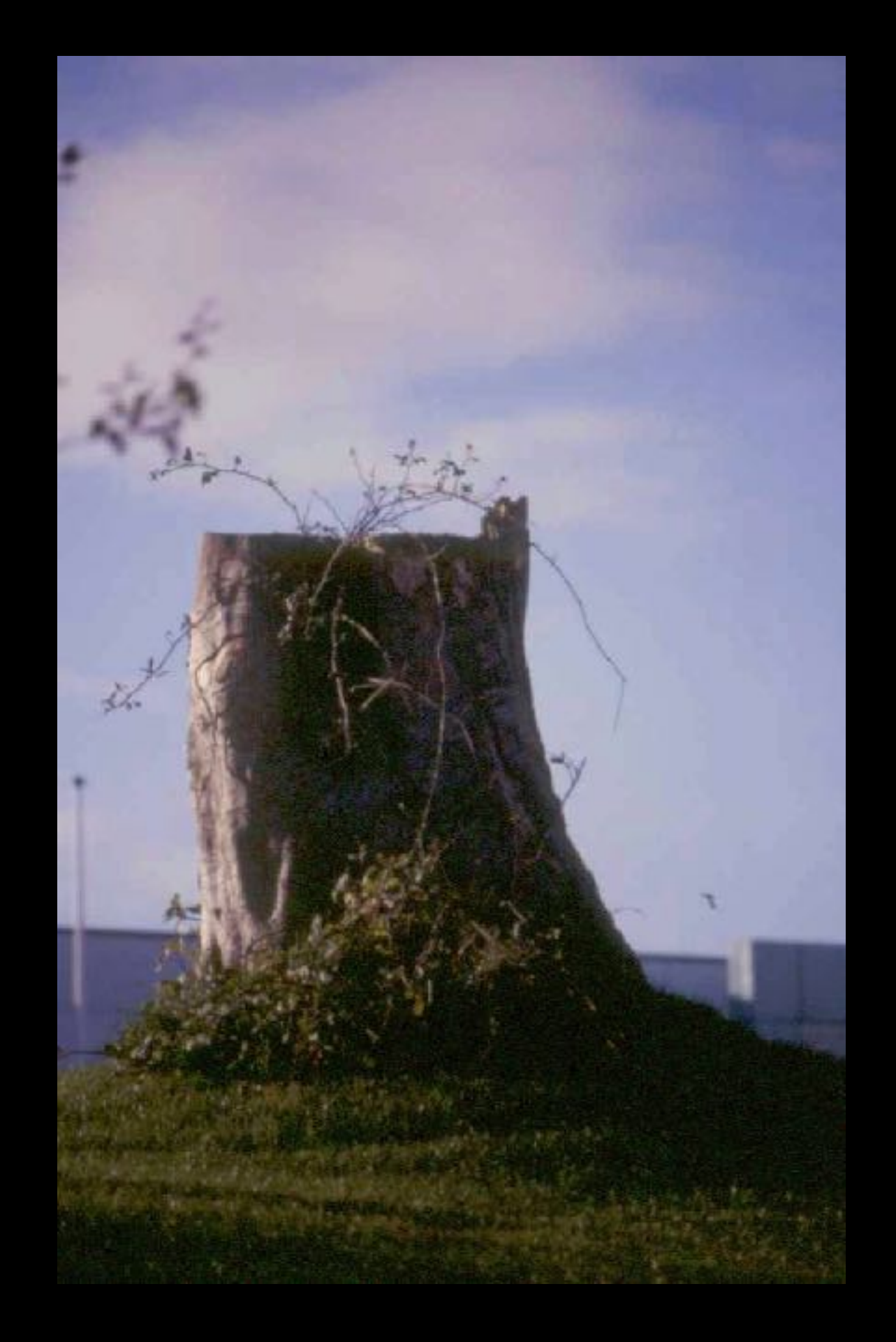
A planted 200 year old tree stump with attendant brambles