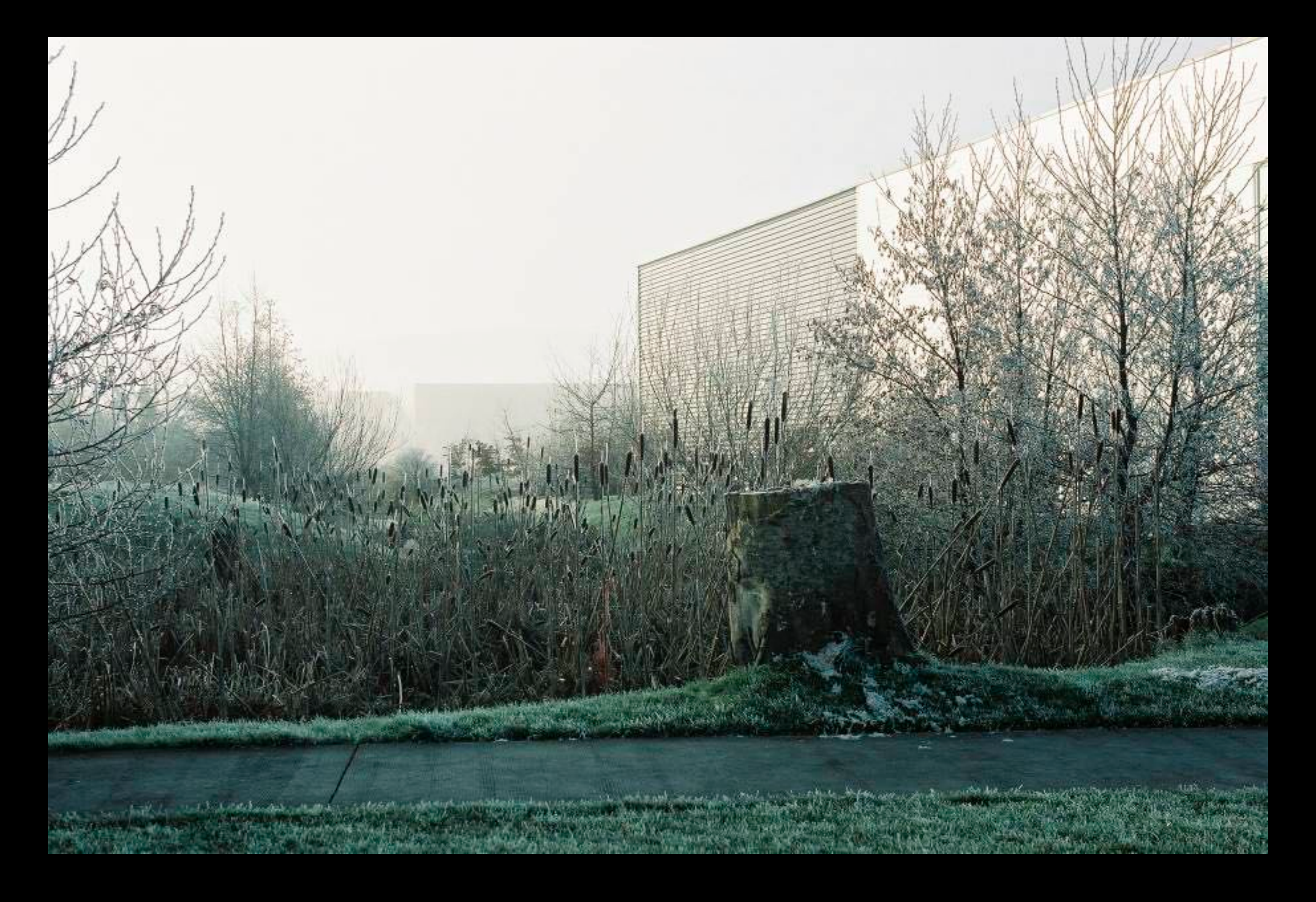
To compare the power of one against the many