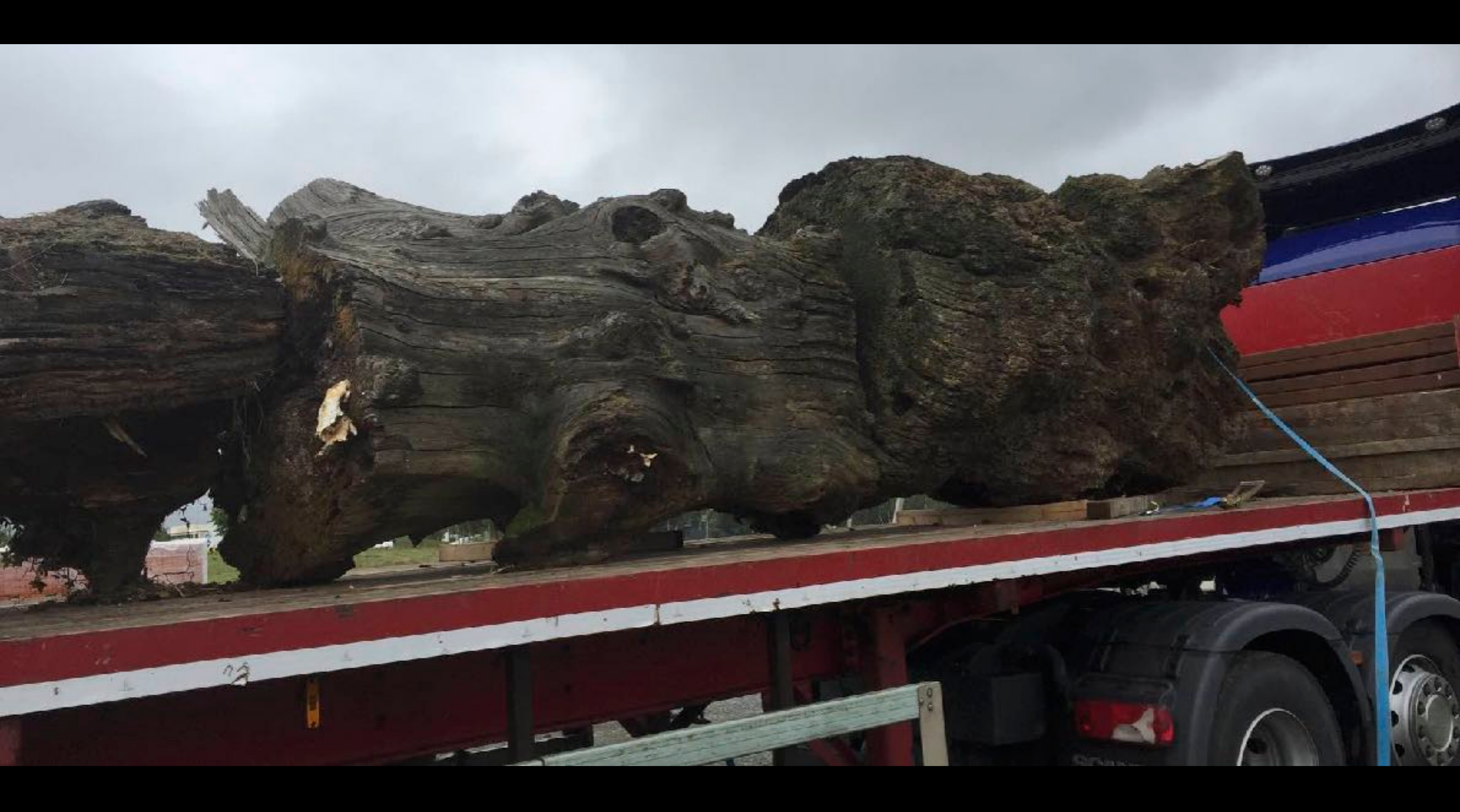
With size and weight comes power, with age comes character