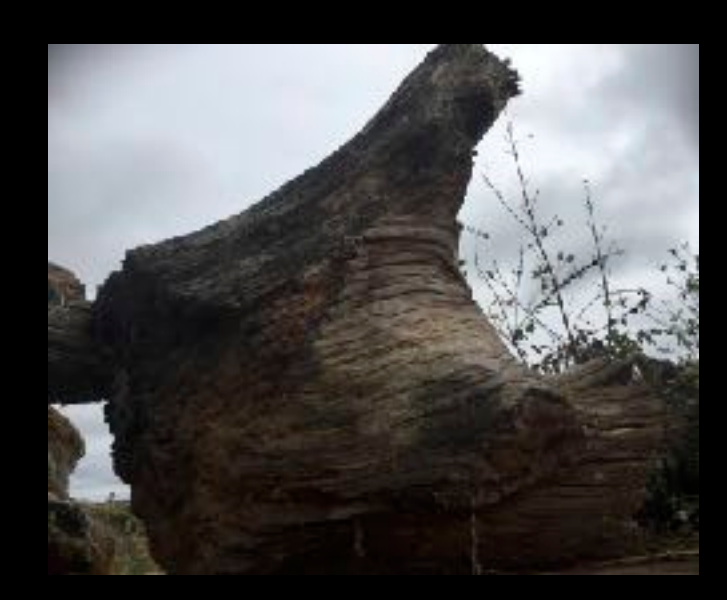
Scots Pine and Oak stumps with attendant Rhododendron