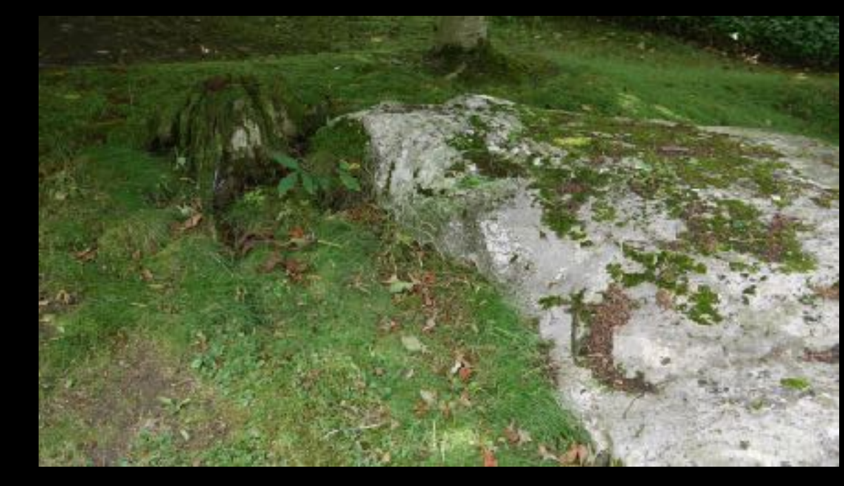
Planted rocks and tree roots dressed with lichen and mosses.