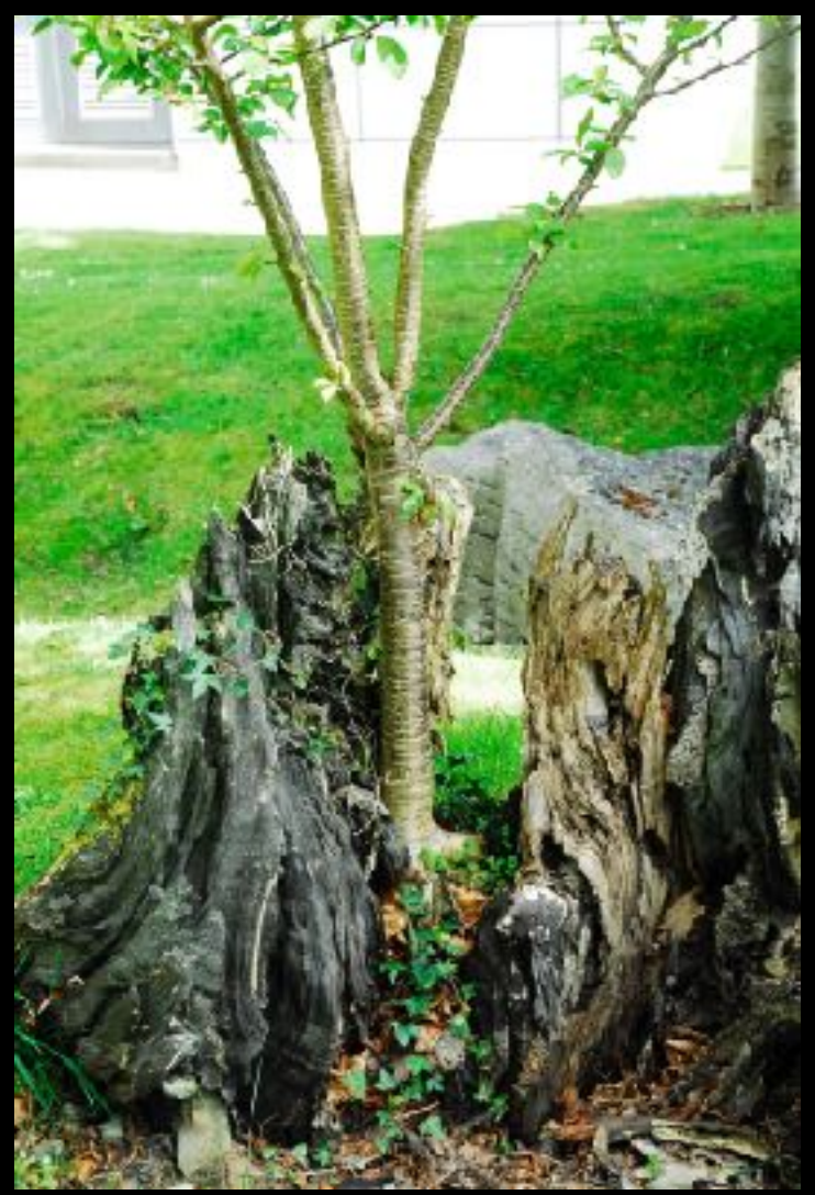
A Wild Cherry tree seeded by bird droppings into a planted and decaying tree root at XILINX